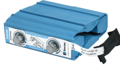
Wedge y Wedgekit